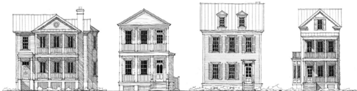
Edge Lot Elevation